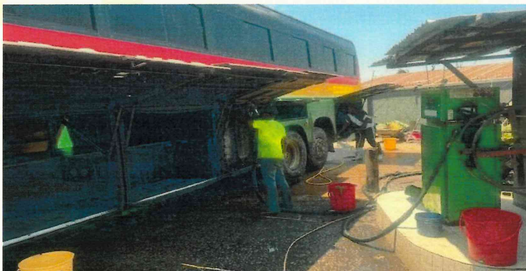
Picture 2: Consumer installation facility owned by ABC Upper Class & Transportation

The team verified the stock available in AGO Tank. It was observed that 7,500 litres of